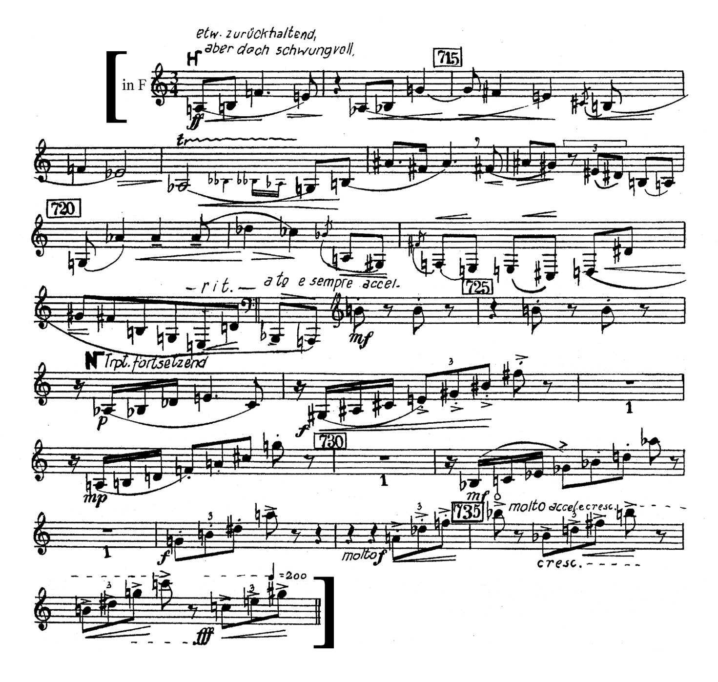
*Reprinted with kind permission by EAM for the 2025 Detroit Opera Second Horn Audition